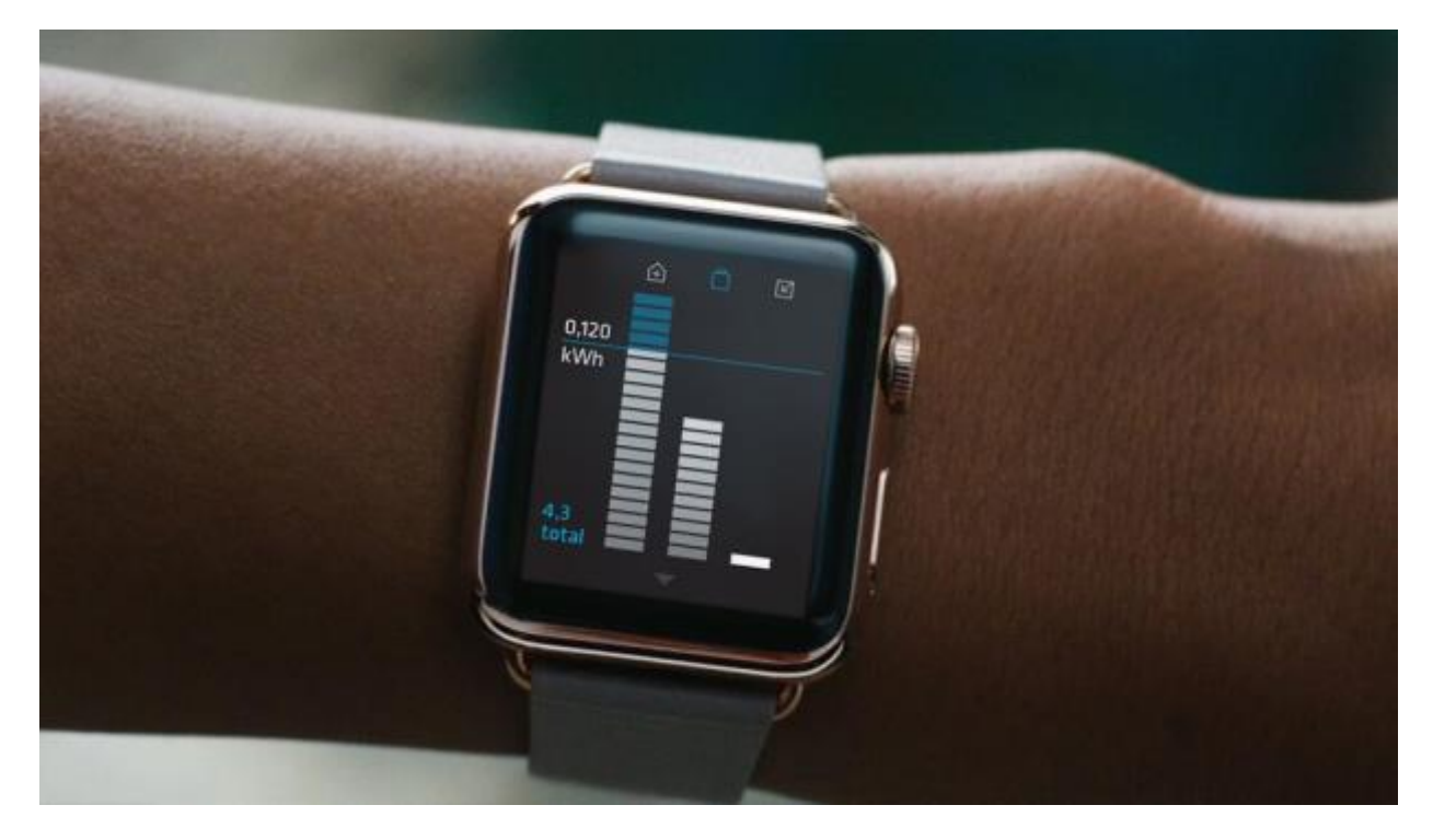
Figure 4: Digital Status Unit