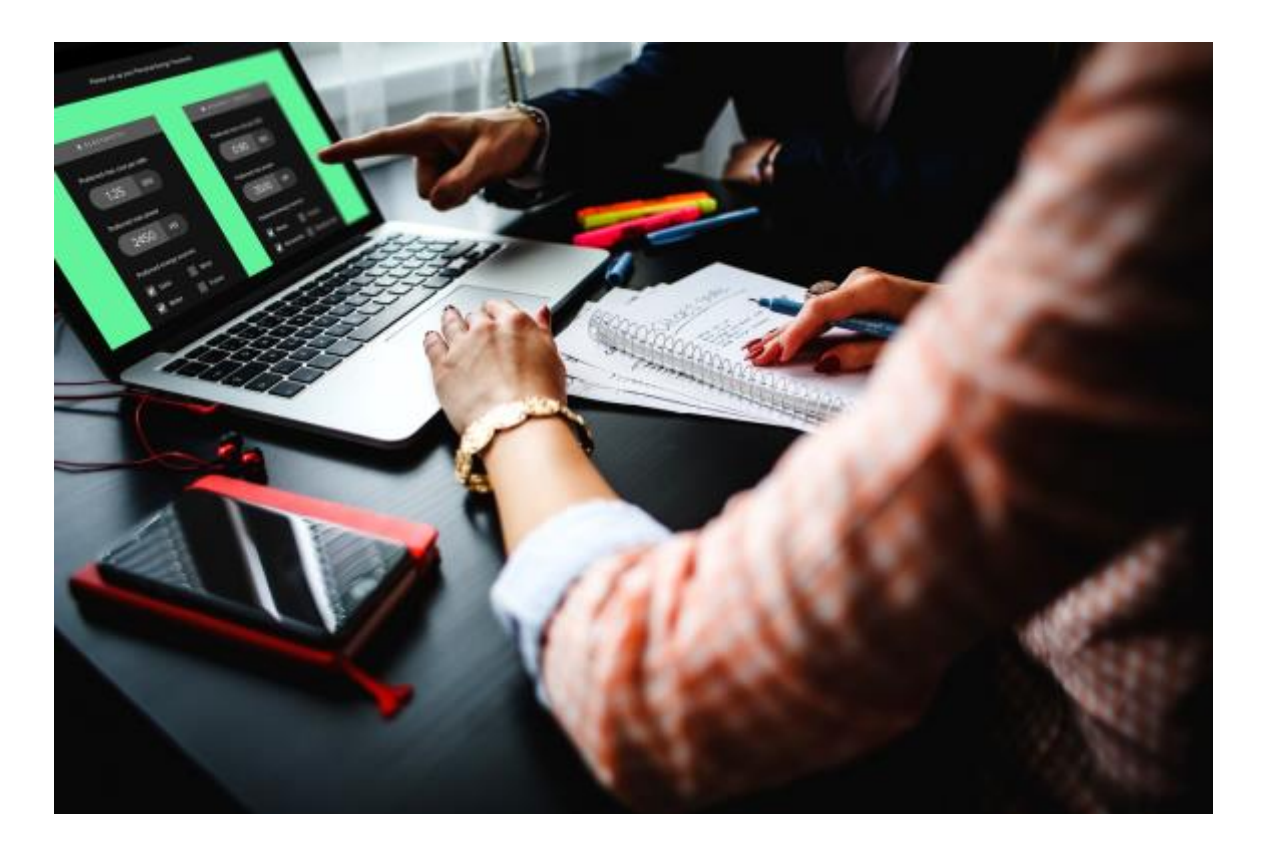
Figure 1: Activity Organizer