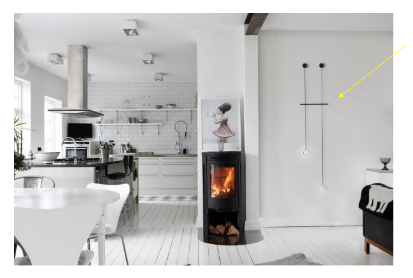
Figure 3: Status Unit in an interior